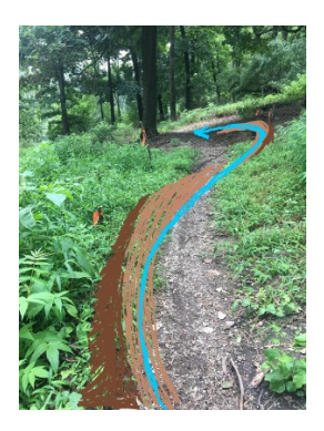
Part 2 - Broken Arrow trail is the green trail and the area of focus is the thick yellow line along Broken Arrow trail just prior to Fireman's Trail.